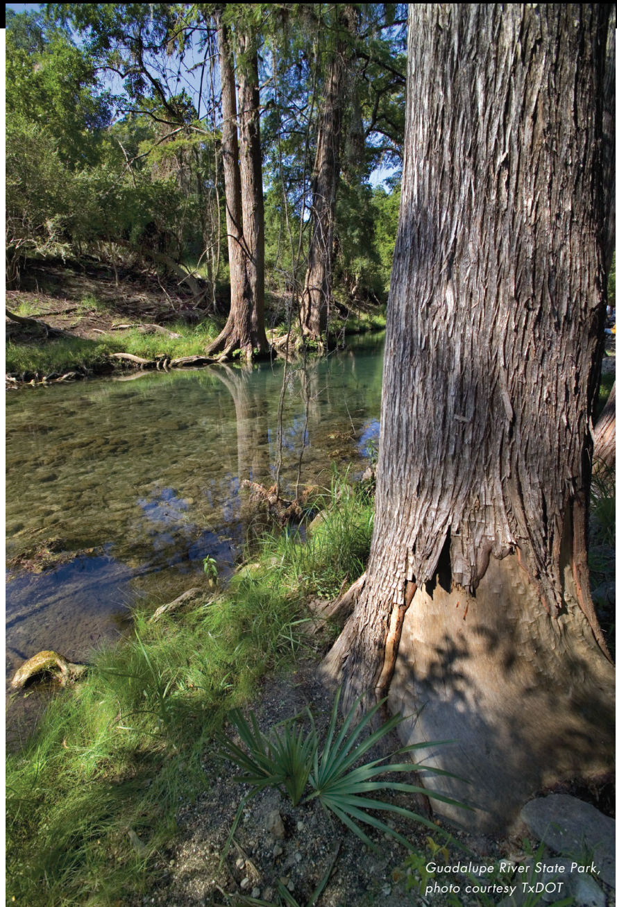
Guadalupe River State Park

The goals for the Office of Water include making balanced decisions based on sound science, proactively working with stakeholders to imple-