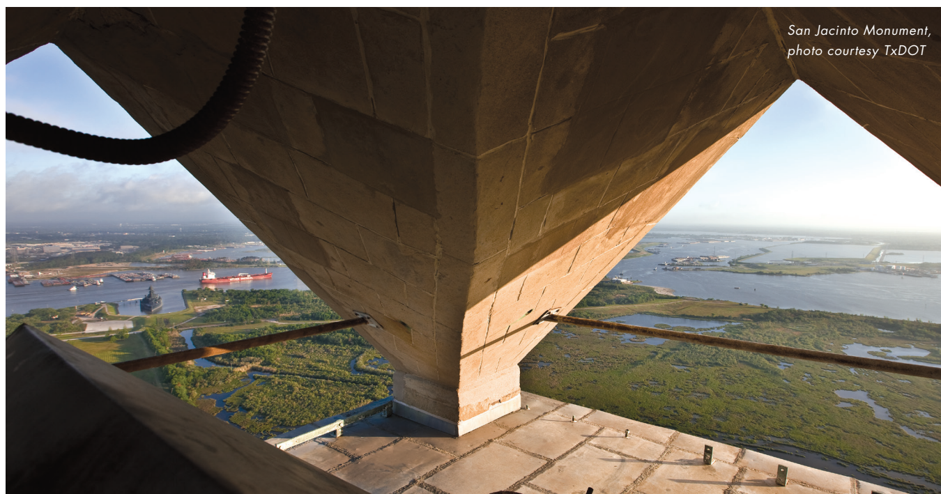
San Jacinto Monument

The Toxicology Division helps the TCEQ evaluate the potential for chemicals to harm human health, interacts with stakeholders, drafts rules, and makes technical recommendations related to permitting, remediation, monitoring, and enforcement. Discussions such as the ones held in this workshop will ultimately result in research that will inform agencies that make regulatory decisions, including ones that do risk assessment.