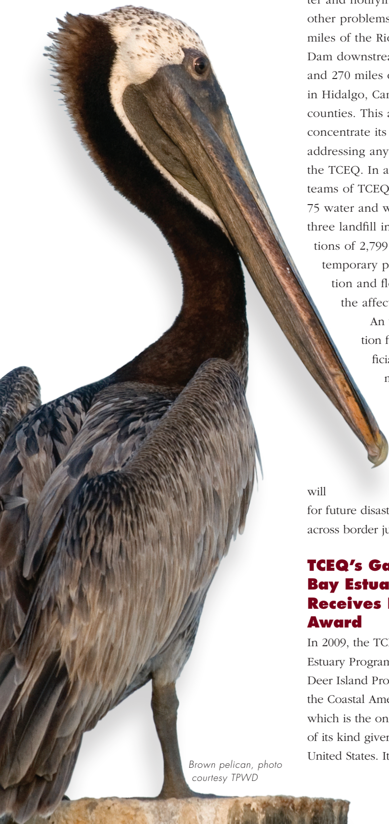
Brown pelican

TCEQ staff acted as the “eyes and ears” of the IBWC by patrolling flood-gate levees saturated by the floodwater and notifying it of any cracks or other problems discovered along 160 miles of the Rio Grande from Falcon Dam downstream to Brownsville, and 270 miles of floodway levees in Hidalgo, Cameron, and Willacy counties. This allowed the IBWC to concentrate its efforts on immediately addressing any issues identified by the TCEQ. In addition, specialized teams of TCEQ employees conducted 75 water and wastewater inspections; three landfill inspections; and inspections of 2,799 lateral gate, levee, temporary pump, and other irrigation and flood-control features in the affected counties.